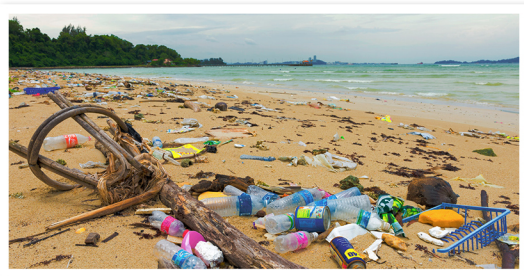
Plastic waste polluting the beach at Kota Kinabalu, Malaysia.

A lot of the waste that is thrown away goes into the world's seas and oceans. This is called pollution. Plastic waste takes a long time to break down and tiny parts of it will never go away. Plastic waste can be harmful to living things.