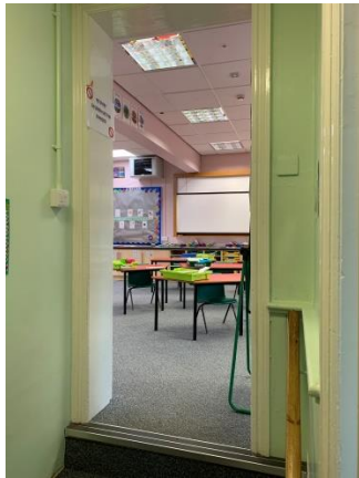
Class 3's door