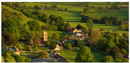
Village of Corton Denham, Somerset

The countryside is a rural area outside of a town or city. Less people live and work in the countryside than in a city.