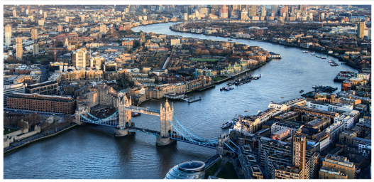
City of London

A city is a large urban settlement where lots of people live and work. There are many shops, restaurants, museums and theatres.