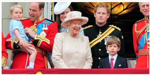
HM Queen Elizabeth II

Queen Elizabeth II is the current monarch of the United Kingdom. She was born in 1926 and became queen in 1952. The Queen is famous across the world.