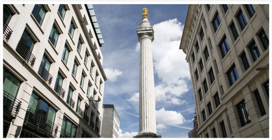
Monument to the Great Fire of London

The Great Fire of London was a significant event in London's history. It began in a bakery on Pudding Lane on Sunday 2nd September 1666. Many buildings were destroyed, including St Paul's Cathedral. Today, a monument stands near the place where the fire began.