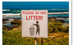
'No littering' sign

A community is made up of the people who live there. People in a community may have some similarities and differences but all people should be treated with kindness, compassion and respect. It is also important to look after the environment in a community. Removing litter and planting new bulbs are great ways to keep the community a nice place to live.