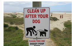
'Clean up after your dog' sign