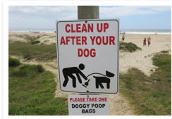
'Clean up after your dog' sign