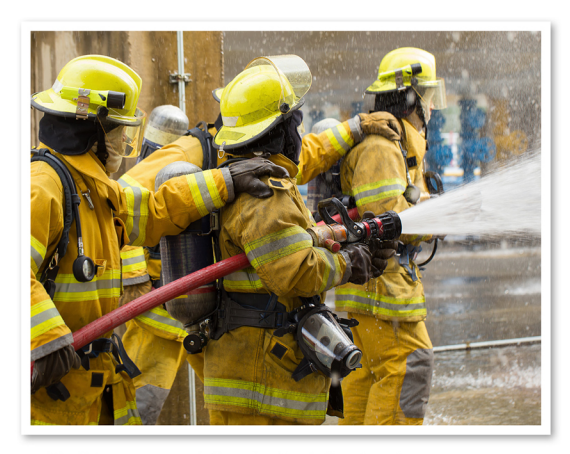
Firefighters are specially trained to help others in an emergency.

People who work in the local community help others in their daily lives, such as librarians or doctors. People who work for the emergency services are heroes because they risk their lives to help others.