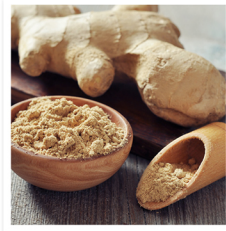
Ginger is a spice.