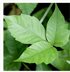
Poison ivy can cause an itchy rash if touched.