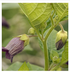
Deadly nightshade can cause sickness or death if eaten.

Some plants can be harmful if they are touched or eaten. They can cause problems with the skin, sickness or even death. It is best to stay away from these types of plants.