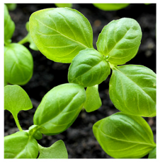
Basil is a herb.

Herbs and spices are plants that can be used in cooking, medicines and perfumes. They can be used straight from the plant or can be dried. Herbs come from the leafy part of the plant and spices come from the roots, seeds, flowers, berries, bark and stems.