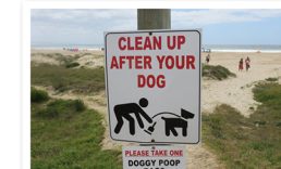
'Clean up after your dog' sign