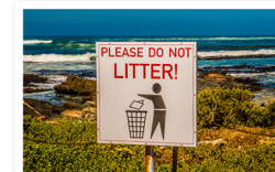
'No littering' sign

A community is made up of the people who live there. People in a community may have some similarities and differences but all people should be treated with kindness, compassion and respect. It is also important to look after the environment in a community. Removing litter and planting new bulbs are great ways to keep the community a nice place to live.