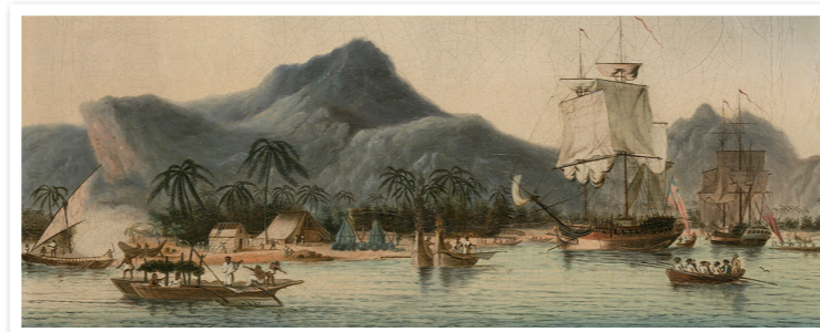
Resolution and Discovery in the Pacific Ocean

In 1776, Captain Cook went on his final voyage. He sailed on the Resolution again and the Discovery travelled with him. He was looking for a route between the Atlantic and Pacific Oceans. He visited the Hawaiian Islands, where he was killed.