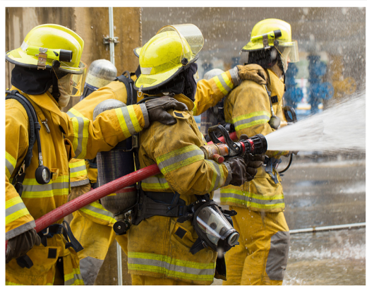
Firefighters are specially trained to help others in an emergency.

People who work in the local community help others in their daily lives, such as librarians or doctors. People who work for the emergency services are heroes because they risk their lives to help others.