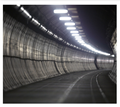
The Channel Tunnel is a tunnel under the sea that links England and France.

A tunnel is a long passage under the ground. Tunnels are usually built as a way of getting from one side of an obstacle to the other.