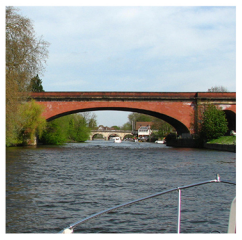
Maidenhead Railway Bridge