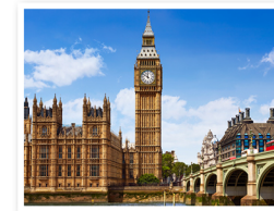
Big Ben, London, England