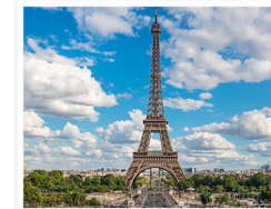
Eiffel Tower, Paris, France