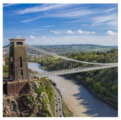
Clifton Suspension Bridge