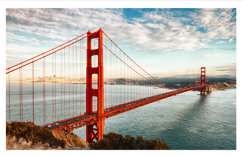
metal suspension bridge

A bridge is a structure built over a road, river or railway that allows people or vehicles to cross from one side to the other. Bridges can be built from a range of materials.