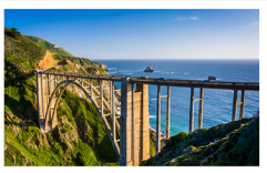
concrete road bridge