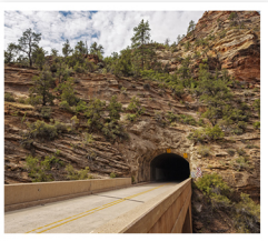
The Zion-Mount Carmel Tunnel in the USA is a tunnel through a mountain.