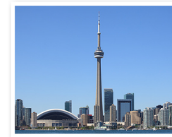
CN Tower, Toronto, Canada

A tower is a tall, narrow structure. Here are some famous towers from around the world.