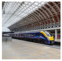
Great Western Railway