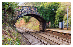
stone railway bridge