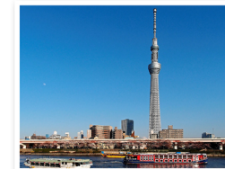
Tokyo Skytree, Tokyo, Japan